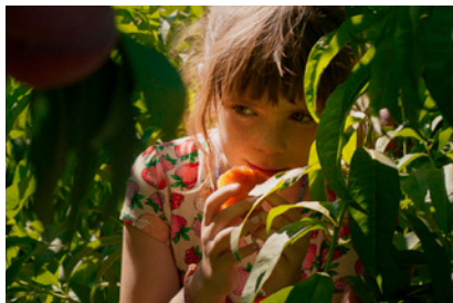
ALCARRÀS CARLA SIMÓN