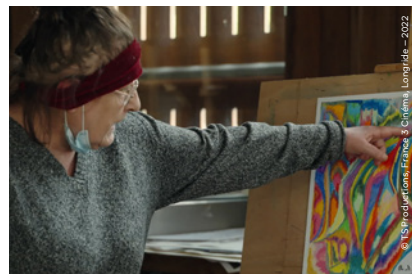
ON THE ADAMANT NICOLAS PHILIBERT