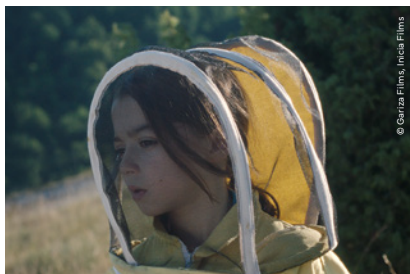
20,000 SPECIES OF BEES ESTIBALIZ URRESOLA SOLAGUREN