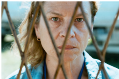
QUO VADIS, AIDA? JASMILA ŽBANIĆ