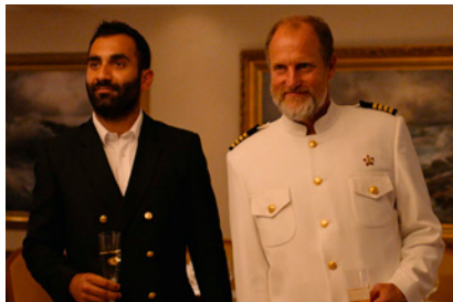
TRIANGLE OF SADNESS RUBEN ÖSTLUND