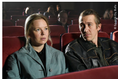
FALLEN LEAVES AKI KAURISMÄKI