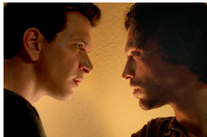
BURNING DAYS KURAK GÜNLER