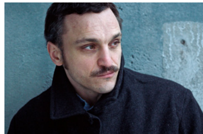
GREAT FREEDOM SEBASTIAN MEISE