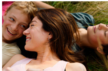
CLOSE LUKAS DHONT