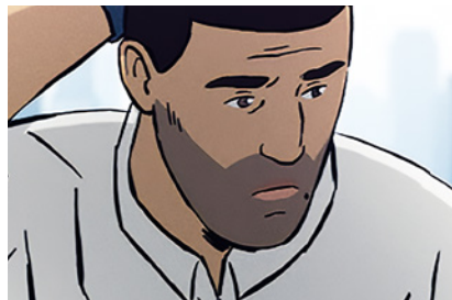
FLEE JONAS POHER RASMUSSEN